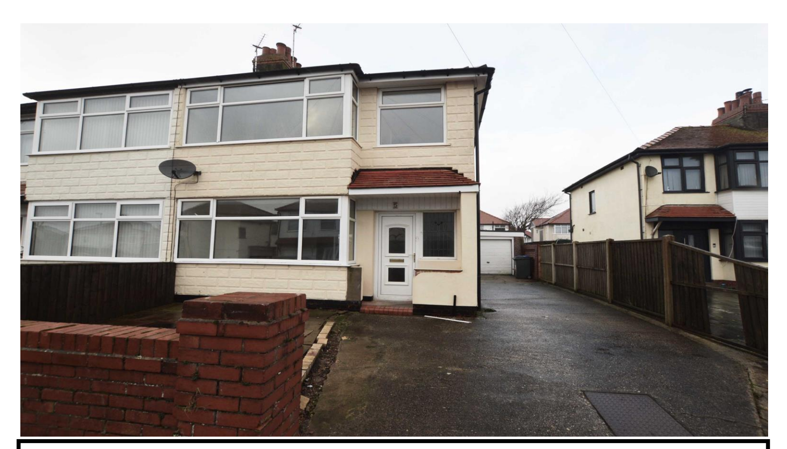
5 BEDALE PLACE, THORNTON-CLEVELEYS, FY5 3PD GUIDE PRICE £127,000